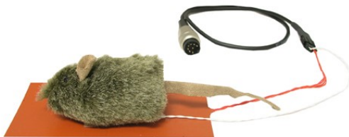
Animal heating pads