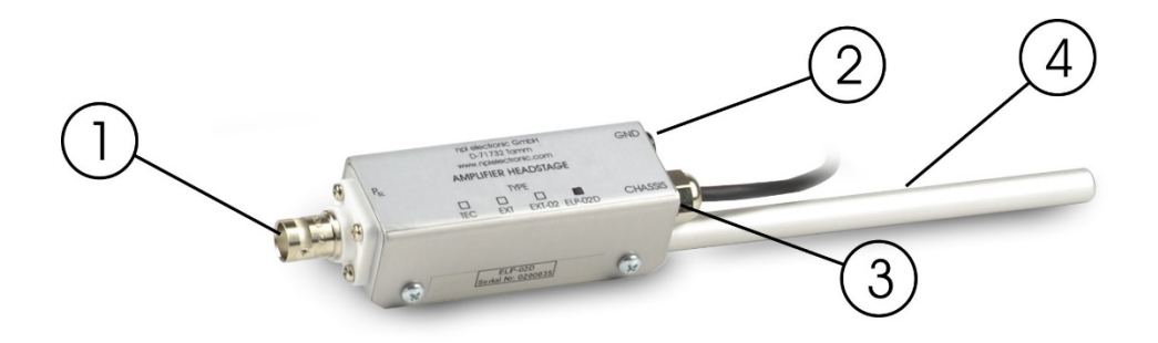
Figure 3: Headstage of the ELectroPORATOR.