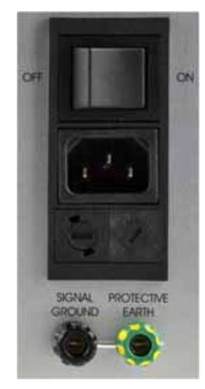
Figure 2: Left: front view of EPMS-03 housing. Right: rear panel detail of EPMS-03 and EPMS-07 housing.

In order to avoid induction of electromagnetic noise the power supply unit, the power switch and the fuse are located at the rear of the housing (see Figure 2, right).